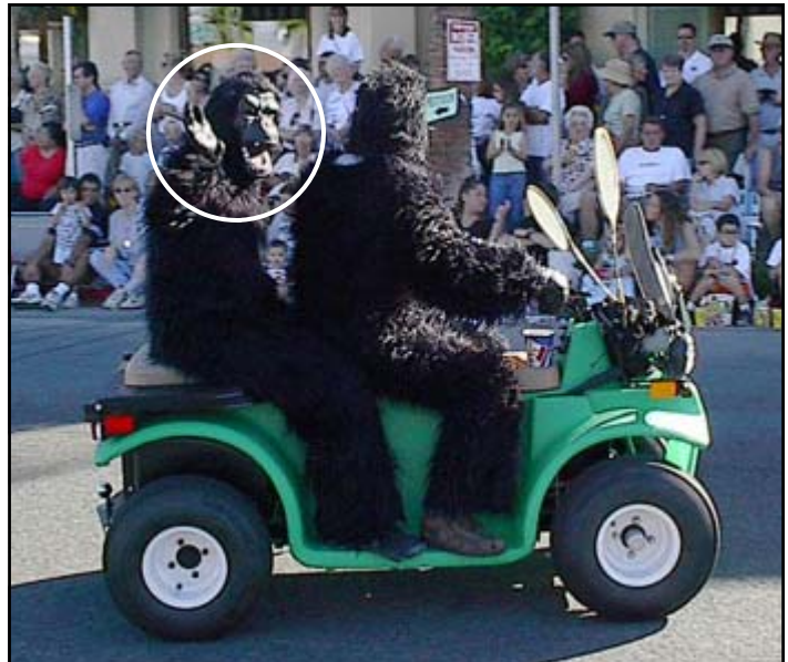
Every year Jill likes to return to Palm Desert (often in disguise) to attend the Golf Cart Parade. (Next scheduled parade: 1:00 PM, Sunday, January 14th, 2007.)